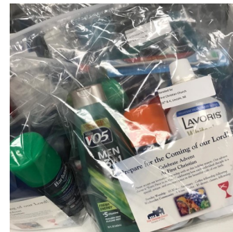
Personal Hygiene Kits for Clinic with a Heart