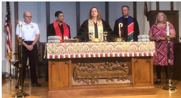
Gathered Around the Table