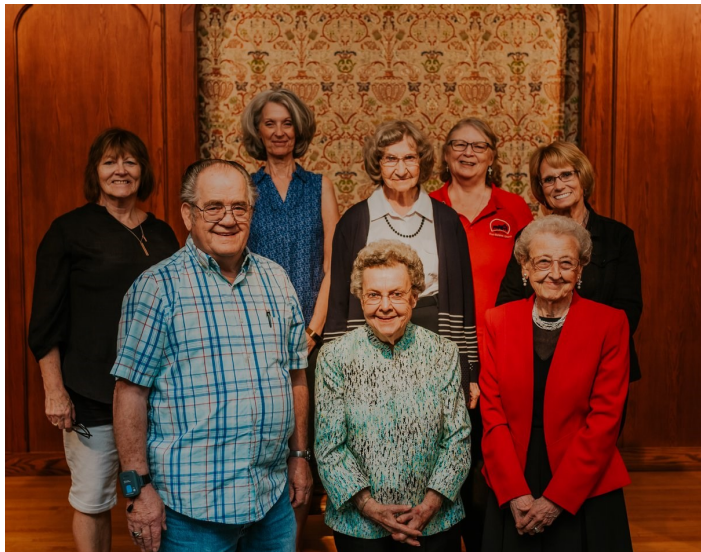
First Christian Family