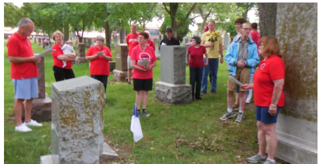
Wyuka Grave Tour