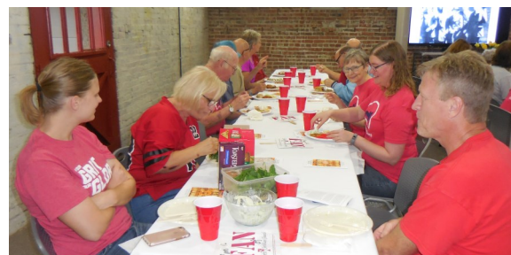
Wyuka Pot Luck Picnic