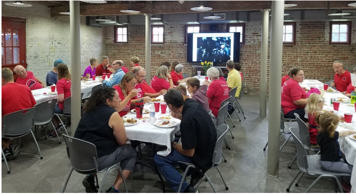
Wyuka Pot Luck Picnic