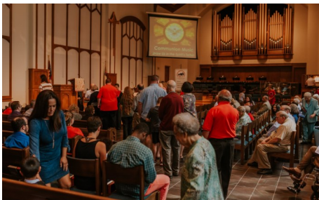
Sunday Morning Worship