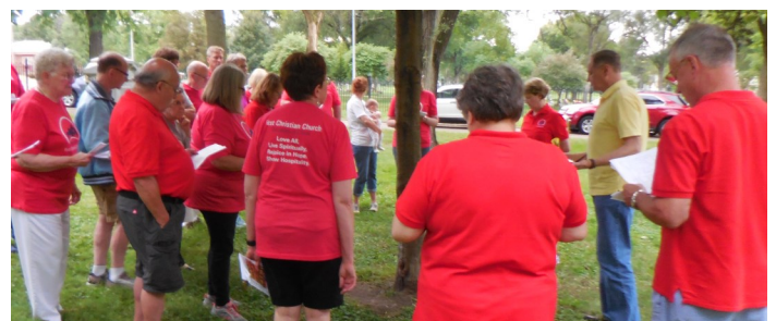
Wyuka Grave Tour