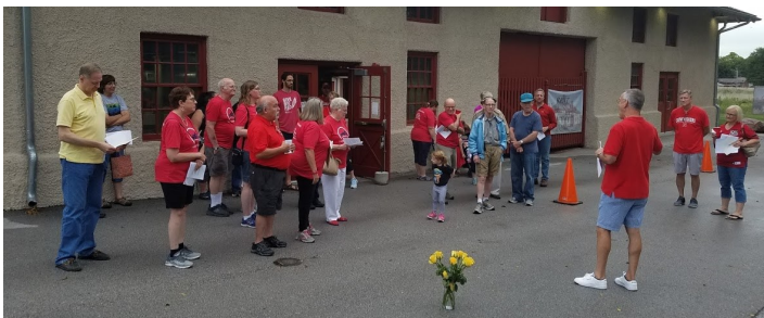
Wyuka Grave Tour